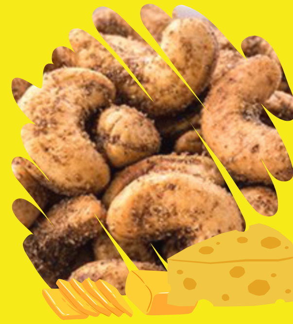
Cheese Cashew Nuts