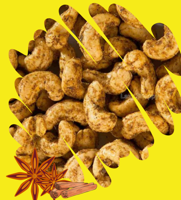
Chat Masala Cashew Nuts