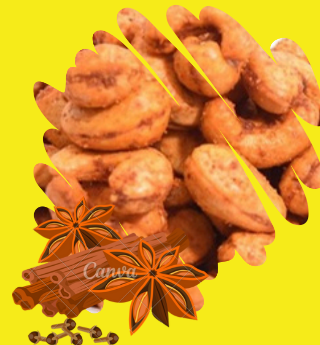
Tandoori Cashew Nuts