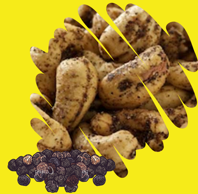
Pepper & Salt Cashew Nuts