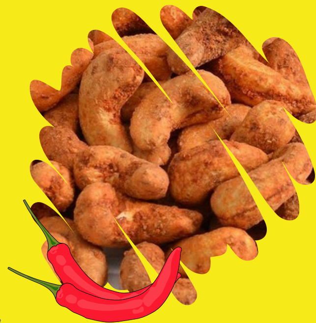
Red Chilli Cashew Nuts

With the objective of making Indian-style cashew snacks and cashew sweets conveniently available to your doorsteps, today we offer you all categories ranging.