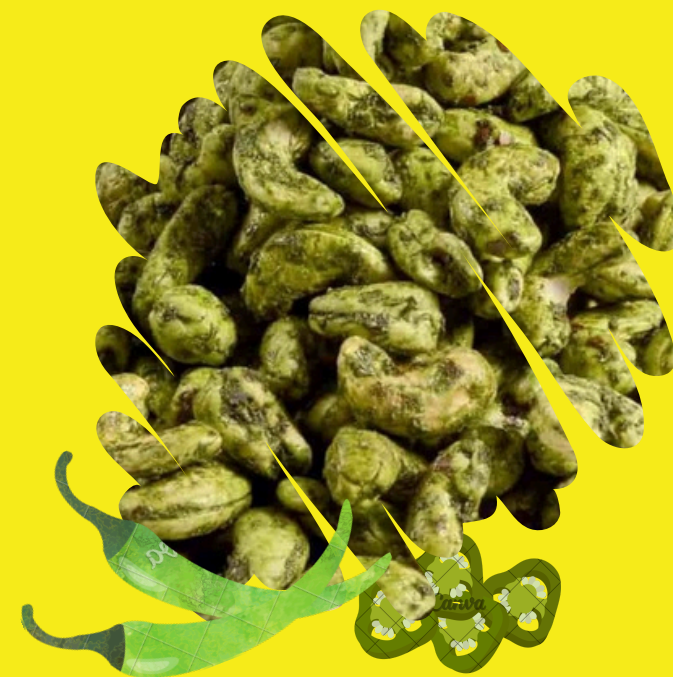
Green Chilli Cashew Nuts