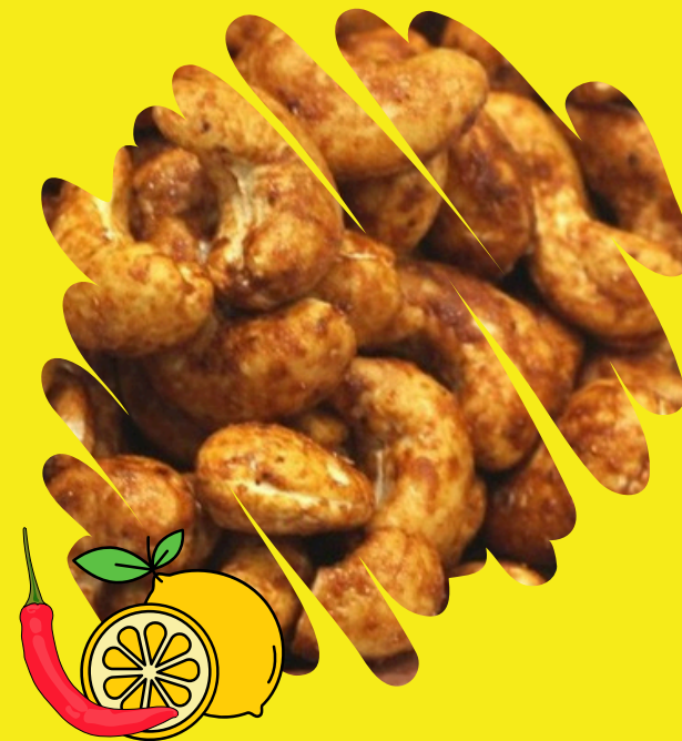
Peri Peri Cashew Nuts

With the objective of making Indian-style cashew snacks and cashew sweets conveniently available to your doorsteps, today we offer you all categories ranging.