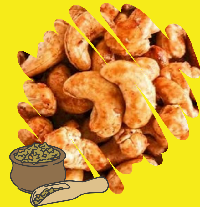
Magic Masala Cashew Nuts