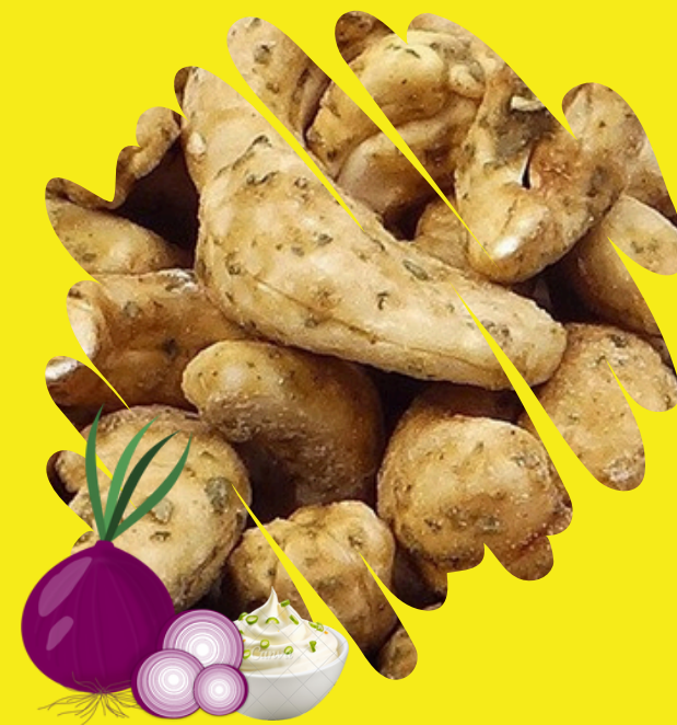
Cream & Onion Cashew Nuts