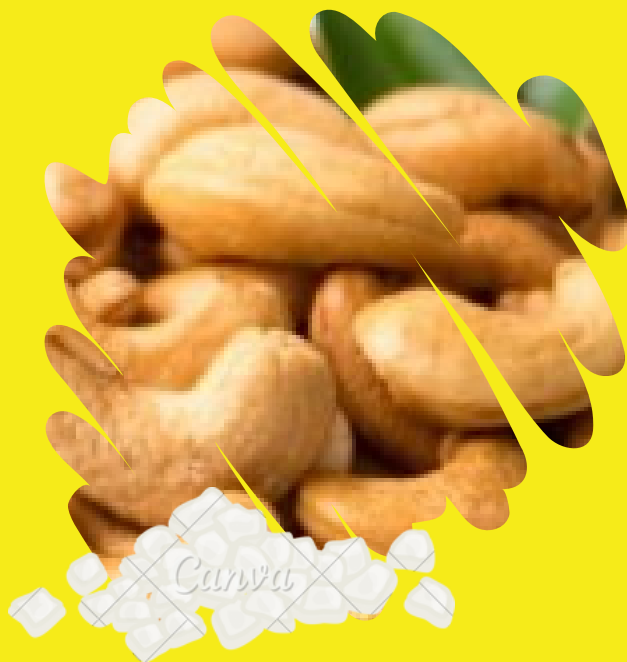
Salted Cashew Nuts

With the objective of making Indian-style cashew snacks and cashew sweets conveniently available to your doorsteps, today we offer you all categories ranging.